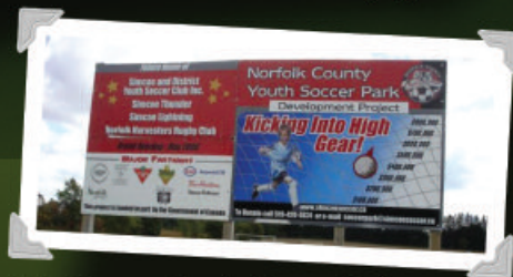
Norfolk County Youth Soccer Park