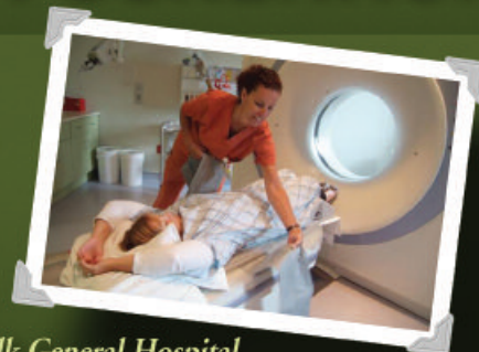
Norfolk General Hospital Cat Scanner

For more details visit our website at norfolkcommunityfoundation.com